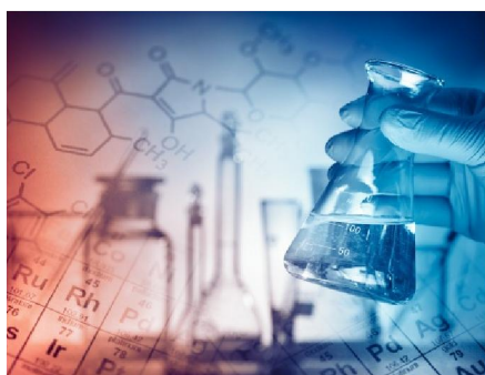
Figure 1: Legend for Figure 1 to be typed here

The Introduction section should start immediately after the abstract, as the next paragraph.